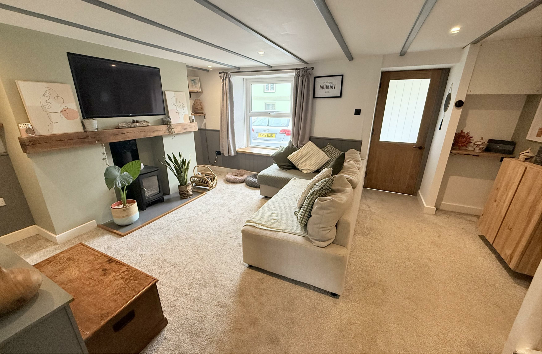
Station Road, St. Blazey, Par, PL24 2ND